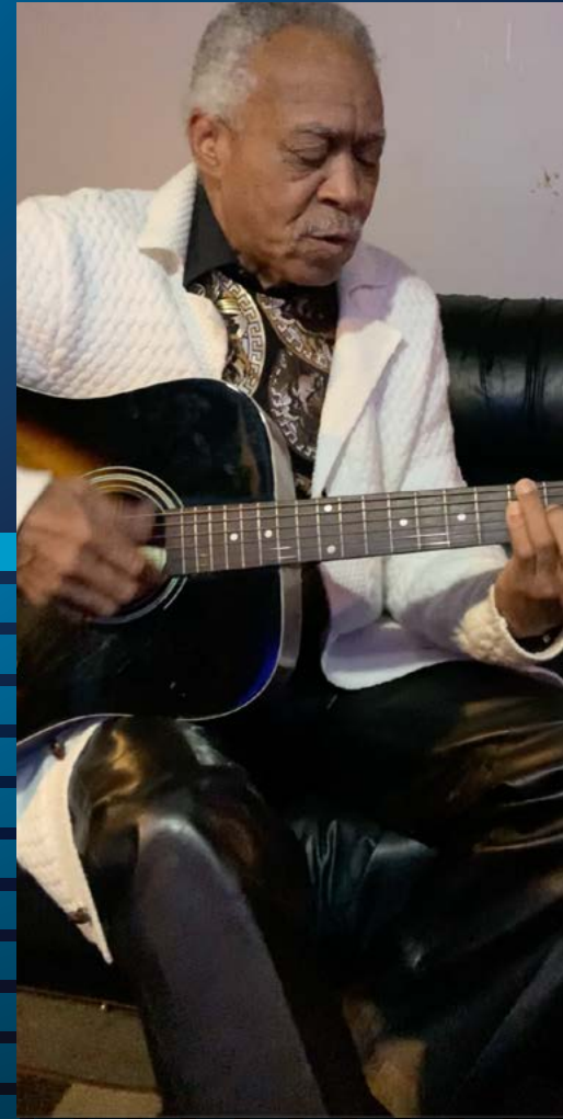
Lets Go Back