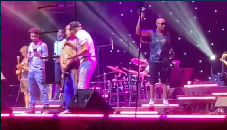
It's So Hard to Say Goodbye to Yesterday